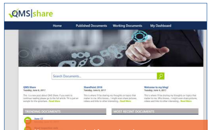
Homepage customized for your brand.